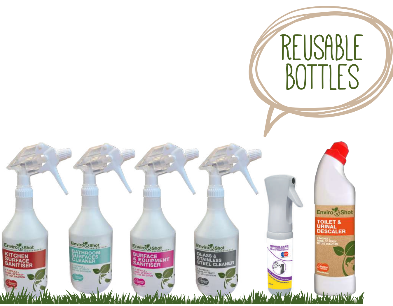
Bottles are available and intended to be re-used with the range