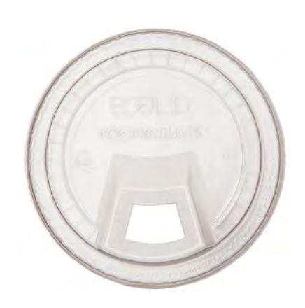
Eco Lids for Edenware Double Wall Cups