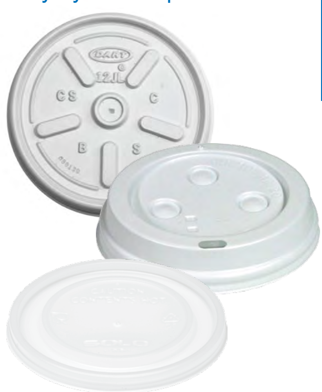
Polystyrene Cup Lids

Designed to keep your drink hot and avoid spills